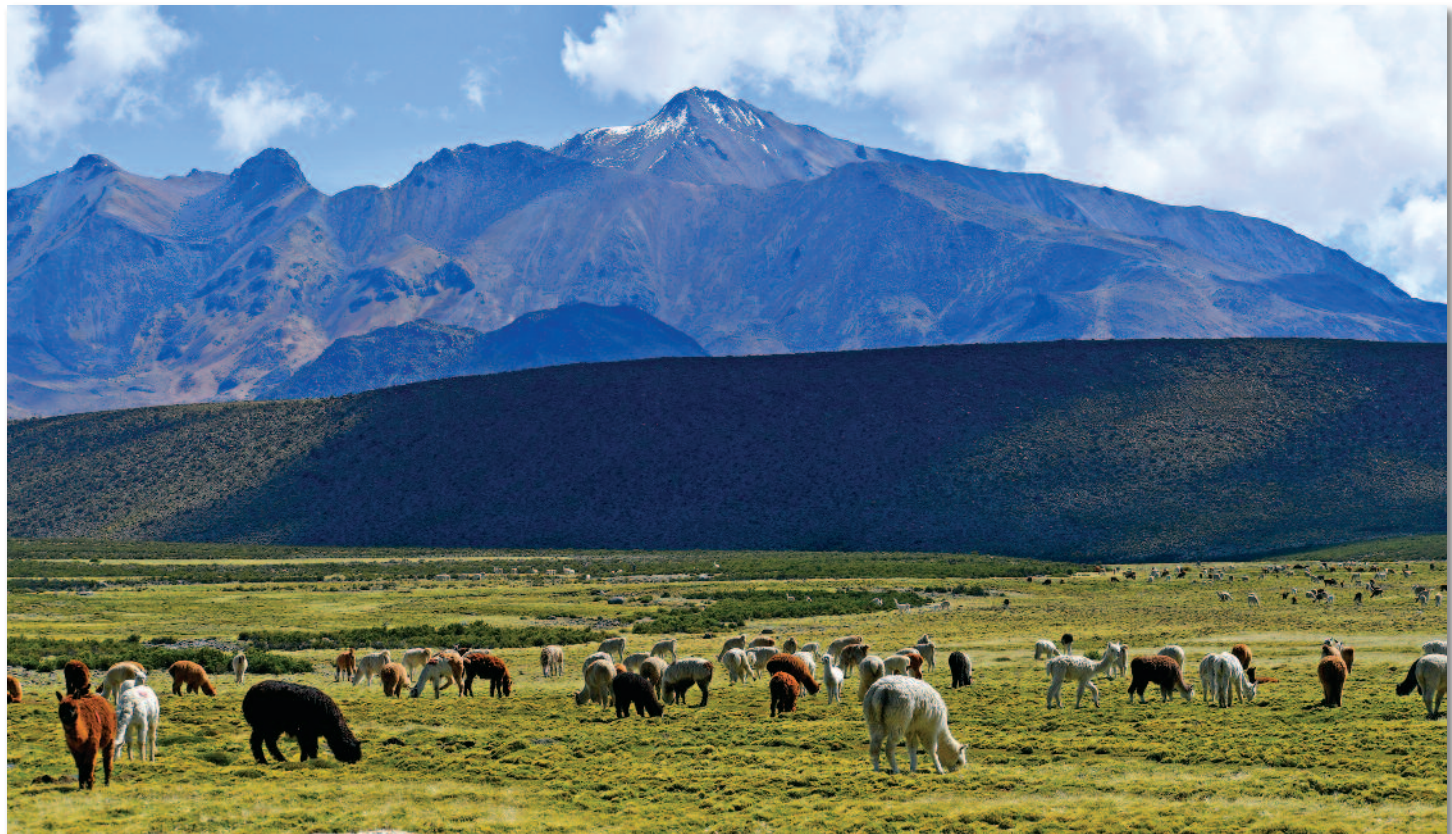
1st Quarter 2020

Botanical diversity aside what bofedales all have in common is exposure to the intense ultraviolet rays from the sun at 12,000 to 17,500 foot altitudes. They receive warmth during the day, due to the proximity to the equator, copious amounts of water, often from multiple sources (snow melt, streams, springs, rain, snow itself, and water via irrigation from nearby lakes), and a relatively flat surface where water collects. Rather than run off, the water tends to sit and be absorbed or just sits, allowing a bofadel to stay wet long after areas outside the bofadel have dried up due to seasonal changes or drought.